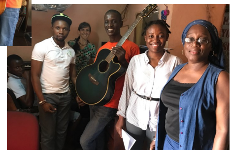
Left: musicians & producers at Studio