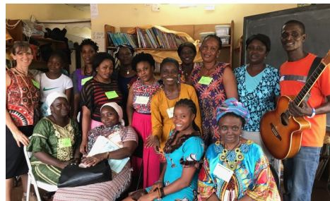
Above: teacher training

International Guest: Ivy taught TE staff valuable Excel computer software skills and partner teachers' record keeping skills. We trained in three World Evangelism Outreaches' schools in the southern province.