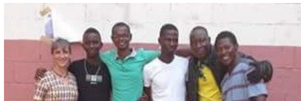
Some Young Worshipers Board Members and Leaders

In a nut shell, we all as YWFSL thanks and appreciate all the relentless supporters of TE, and their faithful prayers of transformational hope for Sierra Leone. This great light and care, gives me hope for us all.