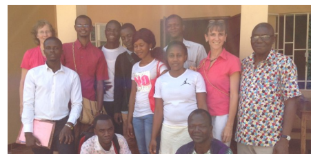
Community Health Evangelism YWFSL & TE Participants