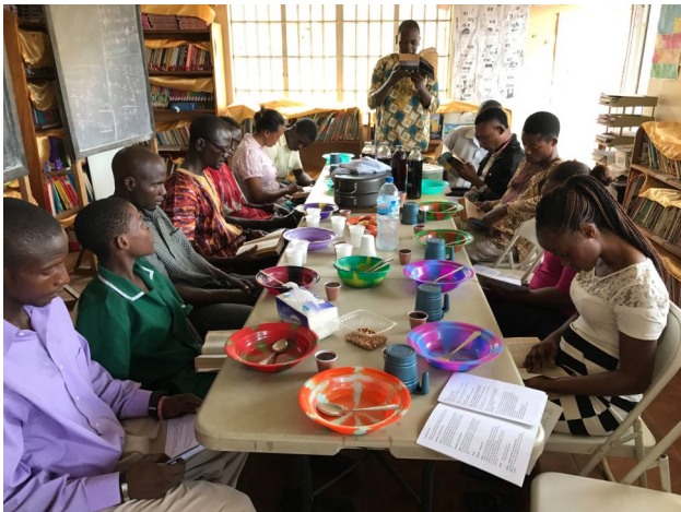
Messianic Passover at TE Resource Centre