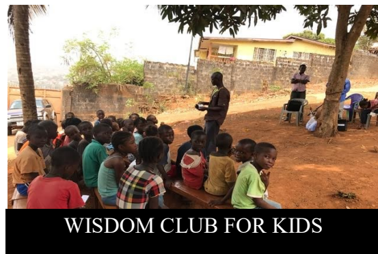
WISDOM CLUB FOR KIDS