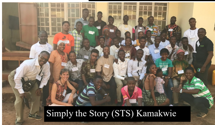
Simply the Story (STS) Kamakwie