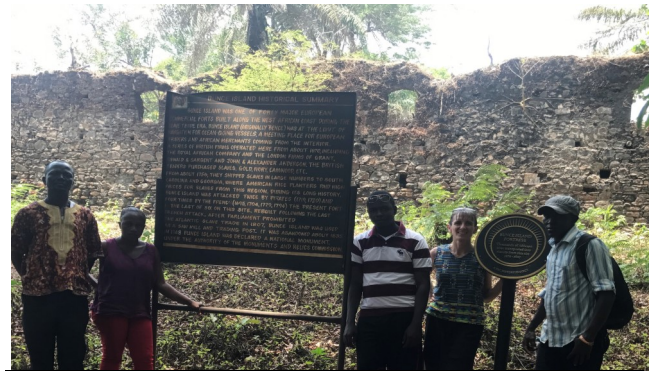
Some of the TE staff took an opportunity to explore Sierra Leone History, Bunce Island where slave were kept and bought before they were shipped.