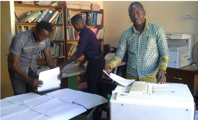
Pictured is TE team printing and compiling STS handouts. The copy and Rizograph machine are valuable ministry tools.

Finally, I appreciate the TE staff for organizing and funding STS. It was also very clear from the participants' faces that they appreciated greatly the StS Workshop.