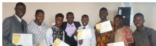
Kairos Missionary Training – YWFSL