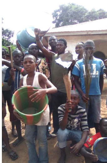
During the Young Worshipers mission trip in Madina they served the community by cleaning the police station, churches and mosques.