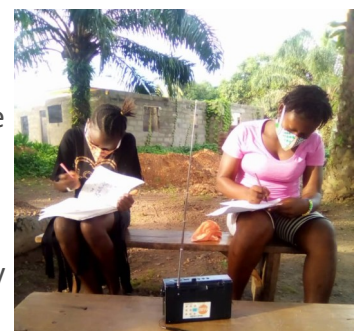
Social distance and masks during radio lessons.

We appreciate your prayer and financial support that is helping us to do what we are doing. We are praying for safety for you and your family.