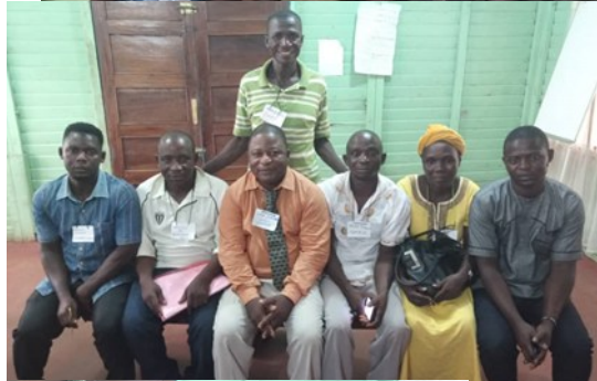
Pictured to the Far Left Edge: Goals set by Disciples who live in the stated area.

2 KAMBIA - Training in the Communities - Schools - Meet regularly * Refresh * Reporting * Areas of target * Challenges in farming - Churches * Train disciples * Organize teaches - Follow up - Exchange/inter-monitoring - In School devotions