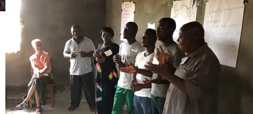
This group translated Jesus Loves Me into Limba Language and taught it to the Limba speaking participants.