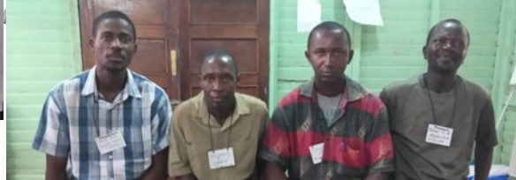
Pictured Above: All the Disciples of Christ who attended the December 4 Fields Disciple Making Training.

May God richly bless these Disciples as they desire and work toward making other Disciples of Christ, for the glory and Kingdom of The Holy Father. May His will be done, on earth, and in our lives, as it is in Heaven.