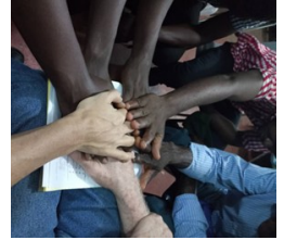
Pictured to the Immediate Left: Christian Brothers and Sisters who set the goals for their areas.

3 PORT LOKO (Maboni, Mabonah, Manamania, Mombi, Boino) 1. Plant 5 new DGS 2. 120 new disciples 3. 32 baptism 4. 12 new leaders 5. Training - TanKoro 4 KONO - Chiefdoms - Gbenese - Nirriya - Feama - Give report - Follow up - Identify new places - Target 4 Chiefdoms - 20 DGS - 100 new disciples