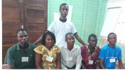
Sierra Leone's Districts Represented as pictured to the left:

3 PORT LOKO (Maboni, Mabonah, Manamania, Mombi, Boino) 1. Plant 5 new DGS 2. 120 new disciples 3. 32 baptism 4. 12 new leaders 5. Training - TanKoro 4 KONO - Chiefdoms - Gbenese - Nirriya - Feama - Give report - Follow up - Identify new places - Target 4 Chiefdoms - 20 DGS - 100 new disciples