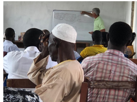
Pictured: Foot washing as we learned about the servant heart of Christ. Agriculture teaching and caterers in the kitchen preparing groundnut (peanut) stew for 85 participants.